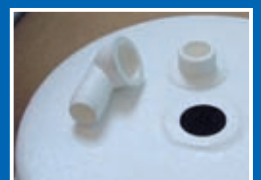
Supplied drain outlet adds 3cm to overall depth