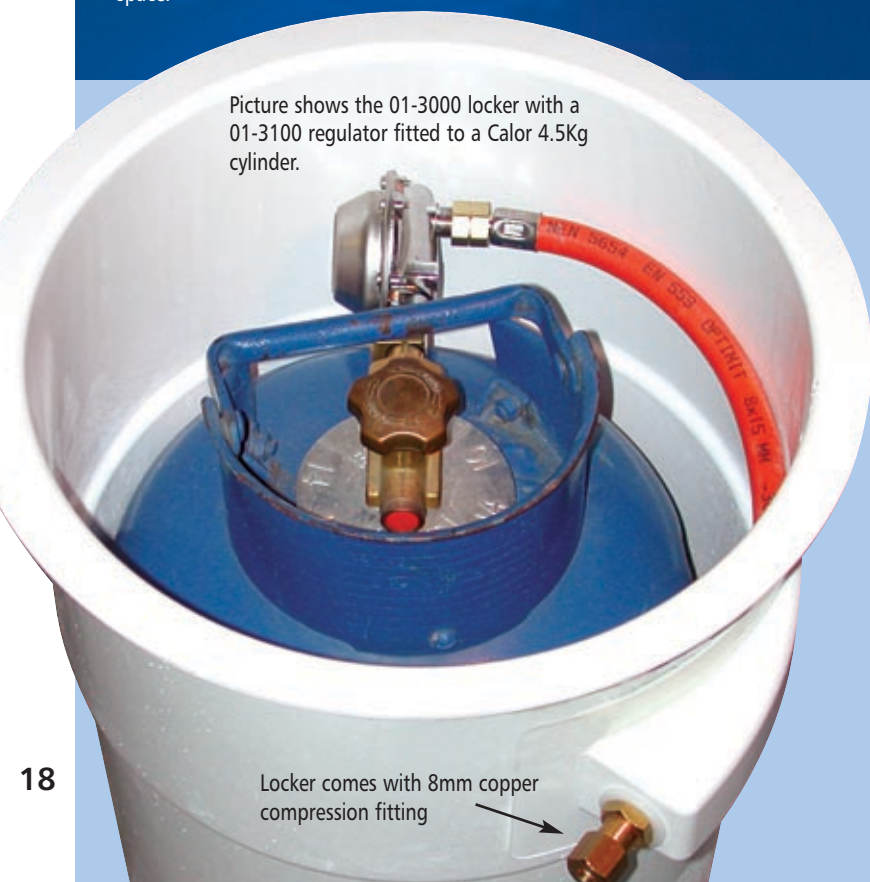
Locker comes with 8mm copper compression fitting